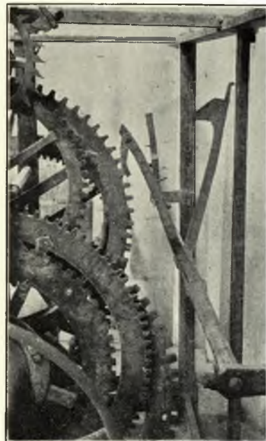
Fig. 4. Striking Levers Lifted to Show their Arrangement.

The lack of precision that would be serious with a simple single-lever strike such as we have