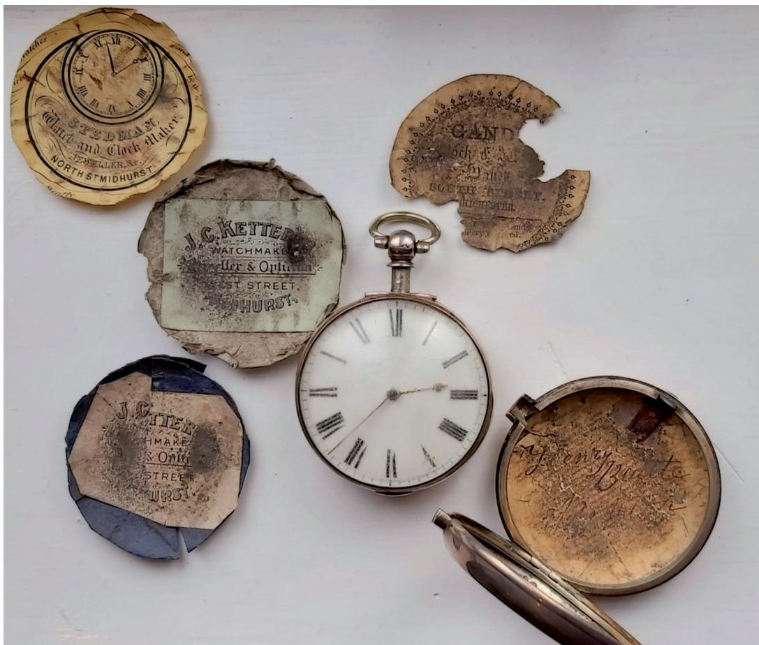
The group of watchpapers all from the same watchcase.