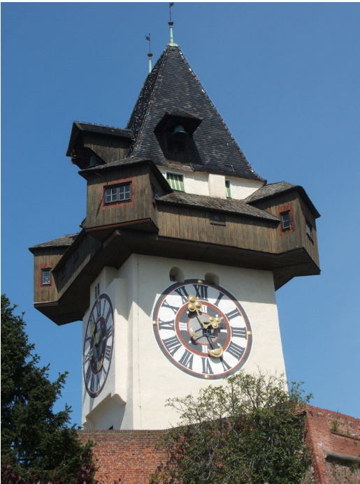
The Graz clock tower.

spot fires in the city at an early stage and to indicate the direction they were when the fire bell would be rung. Originally a fortified medieval defence tower its current structure dates from around 1560 and stands 28m high. Its clock has struck the hours since 1712, originally the dials just had long hour hands but when minute hands were introduced these had to be made shorter and now occupy the centre of the dial and also indicate the quarters. The tower has three external bells and three crests from the former gates and walls of the fortress. The bells are dated: 1645 for the fire bell, 1385 which is the oldest bell in Graz used for the hours on the south-west side of the tower, and 1450 later used as a curfew bell.