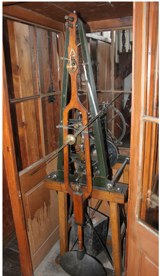
The Mannhardt Freischwinger that released the Glockenspiel.