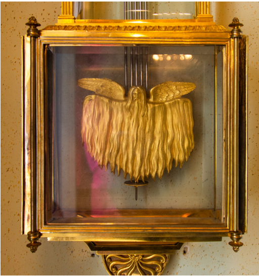
A very unusual pendulum bob: an incredibly bearded man or an interestingly-clothed angel?

suspended grid-iron temperature-compensated pendulum and lunar day and moon face indication. It was equipped with a very unusual pendulum bob design (see photo).