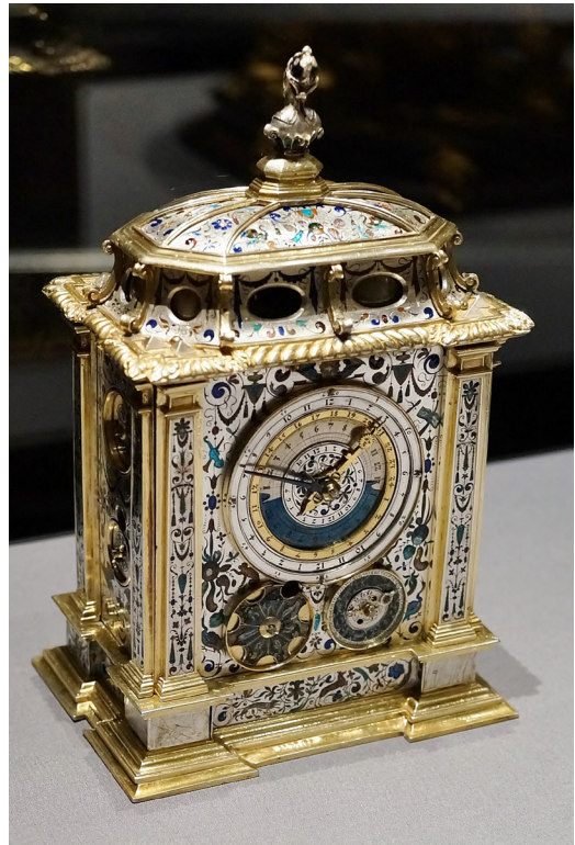
Astronomical clock in silver case by David Altenstetter, 1583, in the KHM.

From the Cittern Player we moved on to the first of the clocks in the collection: a Southern German table clock, dated c. 1545, with three dials including moon phase and days of the week. The going train was driven by springs, the bell mechanism by weights. After this point, apart from a brief interlude to look at the famous 'Saliera' (salt cellar) by Benvenuto