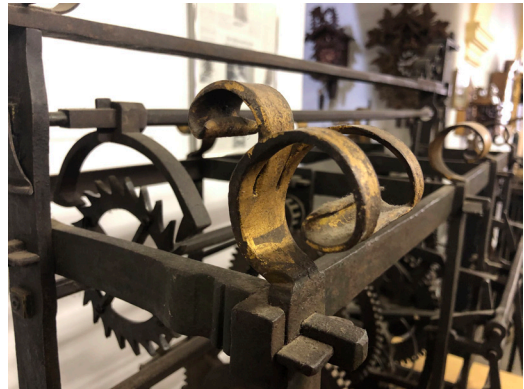
An extraordinary turret clock finial in the Schmolgruber Iron Clock Museum. Photo James Nye..