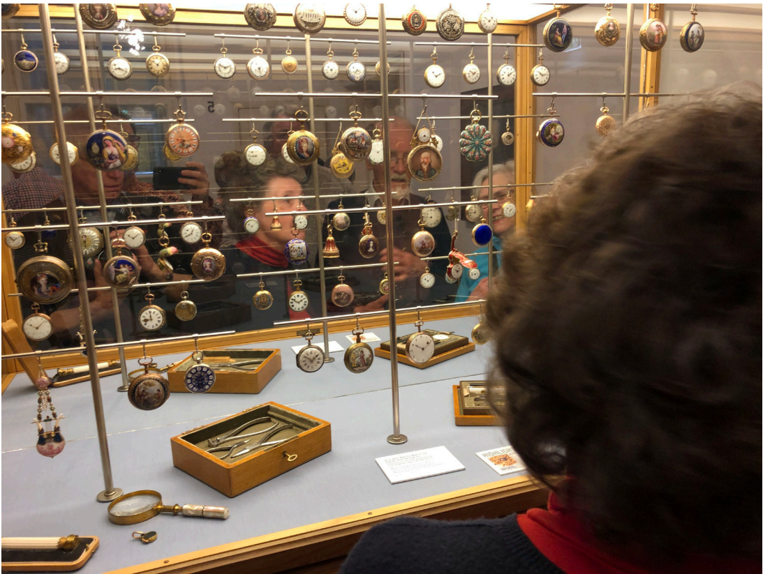
The group reflecting on a watch collection in the Uhrenmuseum in Vienna.

tracking—particularly noticeable for the quartz rod of the master pendulum. From the outside of the main dome we enjoyed stunning views of the City, down across the trees of the picturesque park in which the observatory sits. Vienna's second observatory (the first sat on the roof of the university in the City) dates from the 1870s, officially opened in 1883.