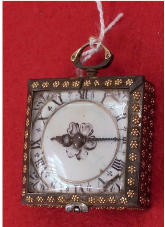
Watch of unusual square form, signed Johann FrauenPreis, Dresden c. 1640.

watches were locally acquired and built up as a comprehensive cross section of most types produced from the seventeenth to the early twentieth century. Being from local sources, very few of these are gold and nearly all are silver or gilt metal. Some are early, dating from the mid-seventeenth century and unexpectedly unusual. At the other end of the displayed 'timeline' is the last, an early wristwatch with leather strap containing a small fob watch. There are a number of interesting examples from the seventeenth century. These are mainly French, German or perhaps partly French and finished by German makers. To some degree or another, all have their accent on external decoration as one might expect. Later eighteenth-century watches are mostly continental in origin, English, French and Dutch predominating. Swiss watches of the most common and established types were represented by an extensive display from the nineteenth century. However, some from this period were undoubtedly produced in Austria, including a number of those odd and characteristically large watches which, surprisingly, were influenced by London-made Turkish market watches, by Isaac Rogers for example. Also present are a handful of genuine early eighteenth-century London watches by makers such as Windmills. Space allows only a small number of watches to be illustrated, but here are three of the best from the collection.