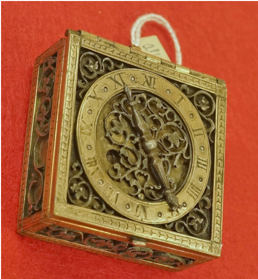
Watch of unusual square form signed Johann Sigmund Schloer, Regensburg.

watches were locally acquired and built up as a comprehensive cross section of most types produced from the seventeenth to the early twentieth century. Being from local sources, very few of these are gold and nearly all are silver or gilt metal. Some are early, dating from the mid-seventeenth century and unexpectedly unusual. At the other end of the displayed 'timeline' is the last, an early wristwatch with leather strap containing a small fob watch. There are a number of interesting examples from the seventeenth century. These are mainly French, German or perhaps partly French and finished by German makers. To some degree or another, all have their accent on external decoration as one might expect. Later eighteenth-century watches are mostly continental in origin, English, French and Dutch predominating. Swiss watches of the most common and established types were represented by an extensive display from the nineteenth century. However, some from this period were undoubtedly produced in Austria, including a number of those odd and characteristically large watches which, surprisingly, were influenced by London-made Turkish market watches, by Isaac Rogers for example. Also present are a handful of genuine early eighteenth-century London watches by makers such as Windmills. Space allows only a small number of watches to be illustrated, but here are three of the best from the collection.