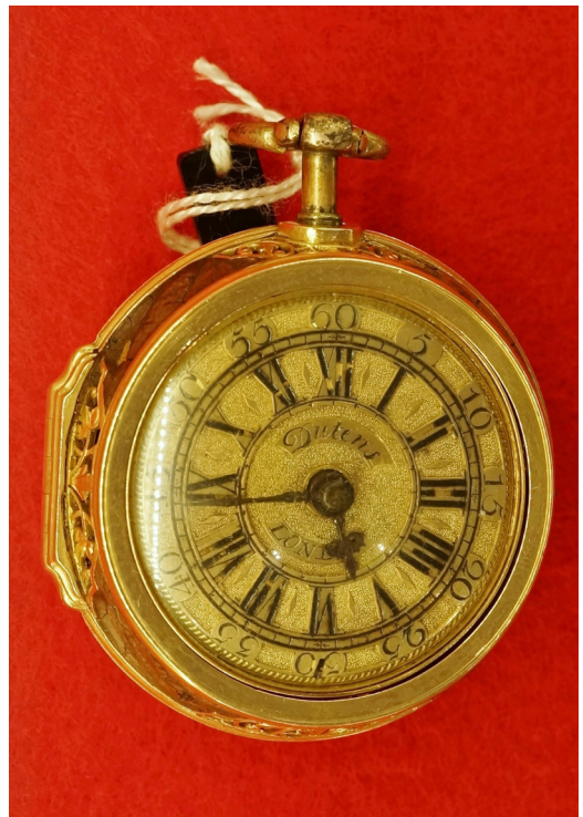
Fine gold pair-cased bell-repeating watch by Dutens, London, c. 1735-40.