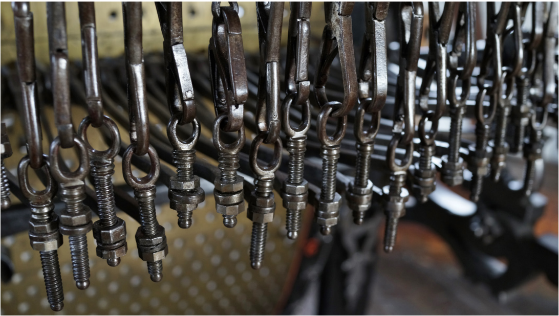
The hammer adjusters of the Glockenspiel (carillon) in the Salzburg tower.

1) Small watch of unusual square form, the case of gilt brass with steel foliate applique. Signed Johann Sigmund Schloer, Regensburg, c. 1650, approx. 40 mm.