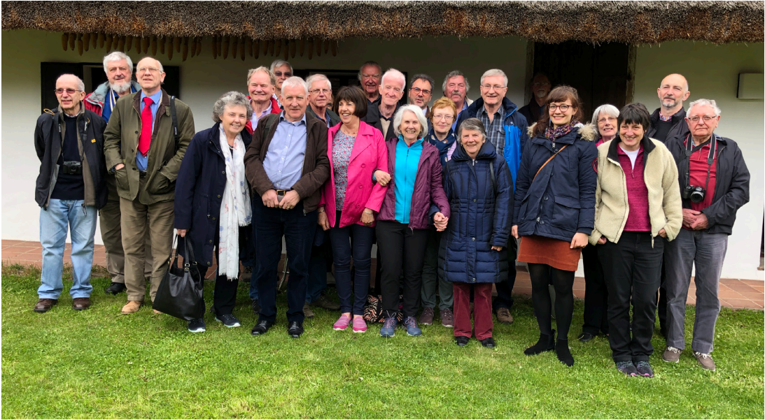
The group outside one of the buildings of the Uhrenstube Aschau.

there was lunch of local hams, cheese and wine in the central single-storey stone farmhouse with a thatched roof, built in 1820. Suitably refreshed we walked the short distance to the main exhibition room with forty-seven tower clocks of all sizes, all beautifully restored, on custom-made wooden stands and each clock clearly labelled. Like the other clocks in the collection most are of wrought-iron posted-frame construction with end-to-end trains, the earliest being Gothic clocks with a foliot, later ones having a verge or anchor escapement. Many of the clocks are from Austria, but examples from Hungary and southern Germany are also included, as well as a few wooden clocks. Up a short flight of stairs is a room with thirteen roasting spits, where we could see the connection with clockmaking, especially as one of them had a very large fusee and a gigantic spring barrel. A nearby restoration workshop included a forge and anvil, as well as clocks undergoing repair. One of them is the oldest in the collection, being Austrian and dating from about 1460. Behind the main farmhouse is a barn with larger clocks, mostly not on stands or working, including a large French clock with an internal countwheel. Wolfgang described the technical and constructional features that distinguish it from Germanic clocks. A study/office in the farmhouse was adorned with numerous domestic wall clocks, made of iron