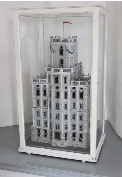
The scale model of the Mathematical Tower.