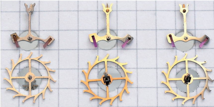
ABEC SMALL PLATFORM - 19 LIGNE POCKET WATCH - 12 LIGNE WRIST WATCH