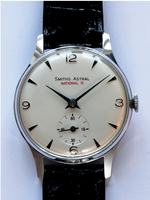
Fig. 1. The National 15.

match the specifications laid down by the Armed Forces and which would, in due course, form the basis for successful domestic sales. 1