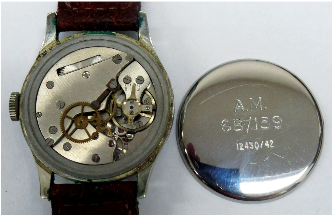
Fig. 7. Wrist watch donated to the Science Museum by Smiths in 1948. The case back is engraved with the Air Ministry stores category 6B/159.

whose watches were supplied to the Air Ministry by Smiths (Fig. 6).