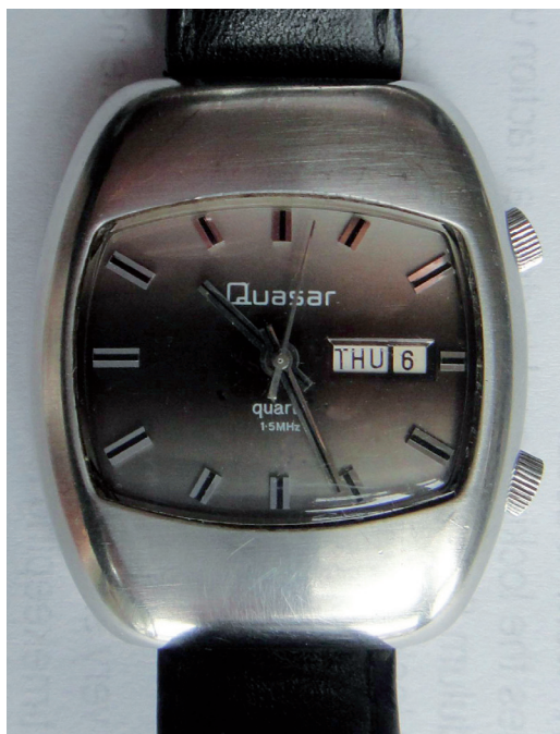
Fig. 20. Smiths Quasar.

The closure of high grade mechanical watch production at Cheltenham was completed by March 1971.