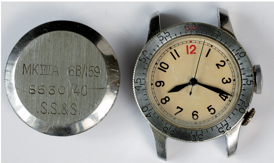
Fig. 6. Mk VII navigator's watch for the RAF, manufactured by Jaeger LeCoultre and supplied to the Air Ministry by Smiths.

Cheltenham watch factory on which occasion he was presented with one of the first 12 ligne wrist watches for the RAF.