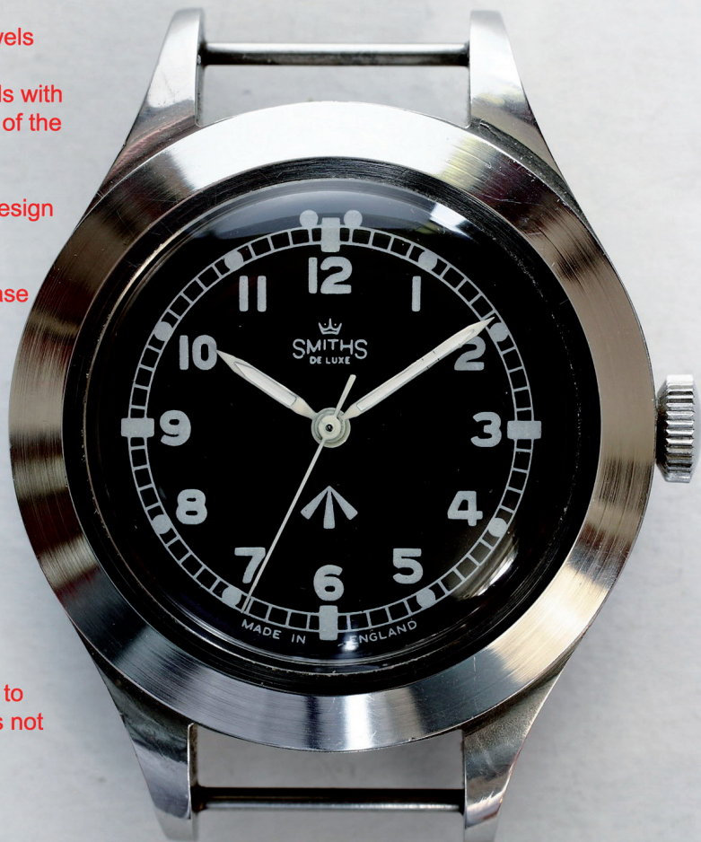
Fig. 19. Smiths navigation watch.

Approval to proceed to production quantities not given