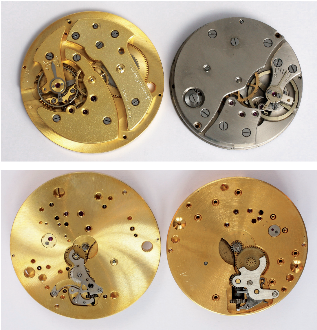
Figs 8 and 9. The Smiths (right) and Jaeger LeCoultre (left) pocket watches, both supplied to the British army at the same time and to the same 15 jewel GSTP specification.

to be dependent on highly skilled labour not available in this country. 8