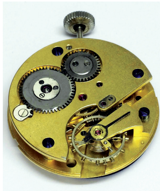
Fig. 17. Smiths Navigator, and Fig. 18. Smiths Navigator movement.

directly driven seconds that avoids the backlash inherent in the indirect system, plus a new design of hacking function that does not touch the balance. To top it all it has a jewelled motor barrel similar to that made by Hamilton in the USA and used only in some of their highest grade railroad and military chronometer watches. All this is hidden under the gilded main plate of traditional English appearance. The large 13 ligne movement is housed in a specially made waterproof stainless steel case of superb quality, with inner antimagnetic shields and fitted with the existing RAF dial, itself forming part of the shield. I doubt that the design of the Hamilton type motor barrel had ever been seen in an English or European watch before, let alone a wrist watch. The standard barrel arrangement has its arbor pivoted in the barrel itself and the mainspring is hooked to the barrel arbor which is turned by the ratchet wheel to wind the watch. Once wound, the arbor is held stationary whilst the barrel turns round its large axle to drive the wheel train. The Navigator motor barrel is very different in that two arbors are used. A barrel arbor that is fixed solidly to the barrel itself, plus a ratchet wheel arbor that is hollow, fixed to the ratchet wheel, and which fits freely over the barrel