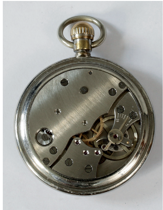
Figs 3 and 4. Back and movement of the pocket watch shown in Fig. 2. It was made for the Army from 1942 in accordance with the General Service Trade Pattern specification.

Ministry of Supply had been keen to support Smiths financially, for instance by the provision of plant and subsidising the manufacture of jewels as well as through the procurement of high grade watches for the armed forces. These plans included the vision that watches developed for the war effort would provide the basis for the creation of a British post-war horological industry.