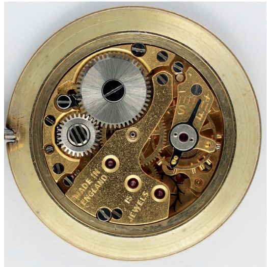
Figs 13a and b. Dial and movement of Smiths ladies watch, made from 1952.