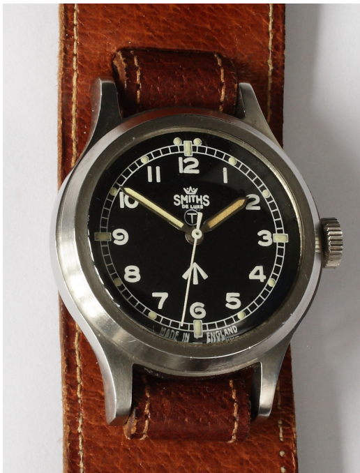
Fig. 14b. Smiths 6B-542 pilots watch.