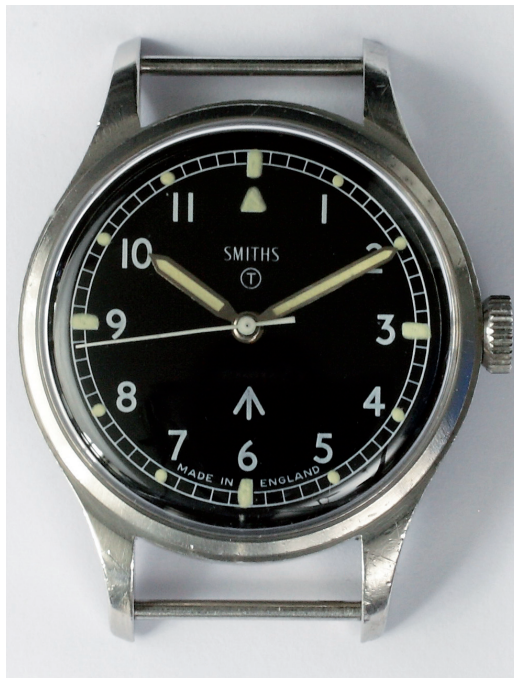
Fig. 14c. Smiths W10 General Service Watch.

Discussions resumed between Smiths and the relevant Ministries and the development of a centre-seconds version of the 12.15 was again initiated. This was achieved by fitting a drive wheel on an extended pivot of the third wheel; an indirect-seconds method similar in principle to that used in the Science Museum war time prototype. The new calibre 27 C.S. proved to be successful and an order was placed under the 6B/542 stores classification. Deliveries to the RAF began in 1954 after which it was made for the domestic market. Smiths post-war military wrist watches based on the 12.15 movement and its derived calibres are shown in Fig.14a. The centre-seconds version for pilots (Fig. 14b) was further developed with a hacking function under the NATO classification W. 10 for all three services (Fig. 14c) in which role it was made in large quantities as a General Service Watch with deliveries starting in 1967. It represented the final development of the basic 12.15 and appeared for sale in the domestic retail market under the Astral name.