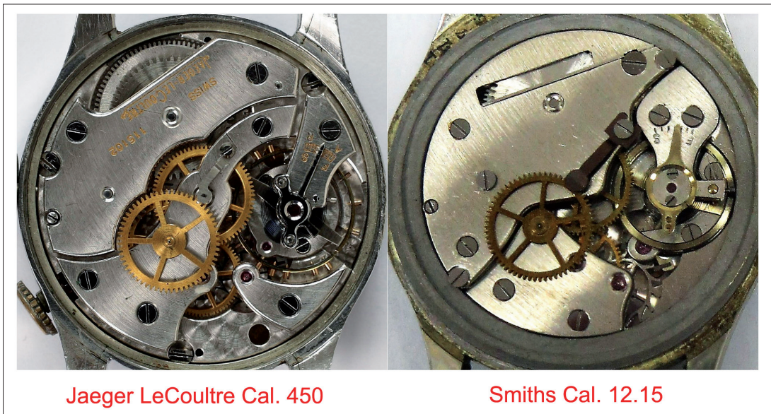
Fig. 10. The movements of the Jaeger LeCoultre 6B/159 (Fig. 6) and the Smiths prototype in the Science Museum (Fig. 7).

It is clear from these images that the layout of the wheel trains is completely different and results in the escapements and balance wheels being on opposite sides of the movements. In addition, the setting lever design used by Smiths and traditionally used to identify makers is unique to Smiths. It is different in that the setting spring does not form part of the setting lever bridge (Swiss part 445) as it does in all Swiss makes including Jaeger LeCoultre. Instead, Smiths used a separate wire spring that acts on the setting lever.