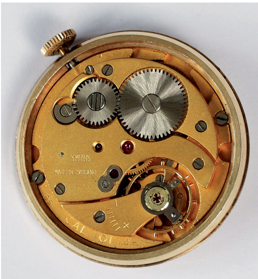
Figs 15a and b. Smiths Imperial and movement. Top right: Fig. 16. Smiths Everest.

The hand wound calibre 0104 was also marketed under the Everest name as shown in Fig. 16. Replacement of the IWC Mk.11 involved the design from scratch of a new high specification navigation watch. The