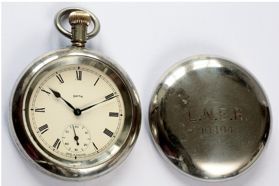
Fig. 11. Smith railway watch for the London and North Eastern Railway (LNER).