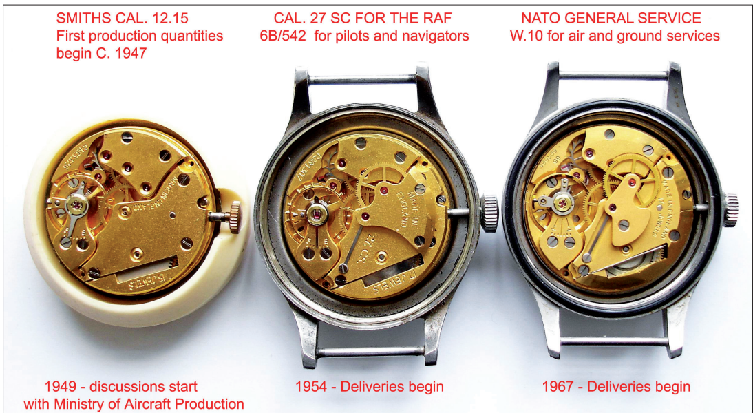
Fig. 14a. Smiths post-war military wrist watches based on the 12.15 movement and its derived calibres.

1955/56. In 1955 Smiths completed the development of their own ladies movement and the calibre 200, a small 17-jewel rectangular watch for ladies was introduced.