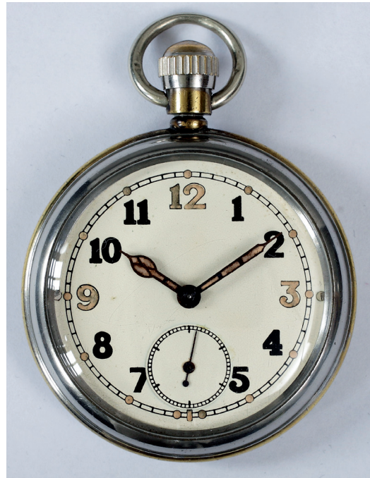
Fig. 2. Pocket watch made for the Army from 1942.

A nationally manufactured watch as exemplified in Fig. 1 was eventually achieved, but its development was faced with many difficulties and took much longer to reach the stage of reliable mass production than anticipated. We will see that orders were placed on the basis of estimated development timescales and, not surprisingly, these proved to be unrealistic. It would not be until the war was over that Smiths succeeded in the manufacture of excellent quality jewelled lever watches, both for the civil market in the UK and for the British and Colonial armed forces. How this was achieved forms the subject matter for this article and I am grateful for the access I have been given to the private papers of Robert Lenoir, who was responsible