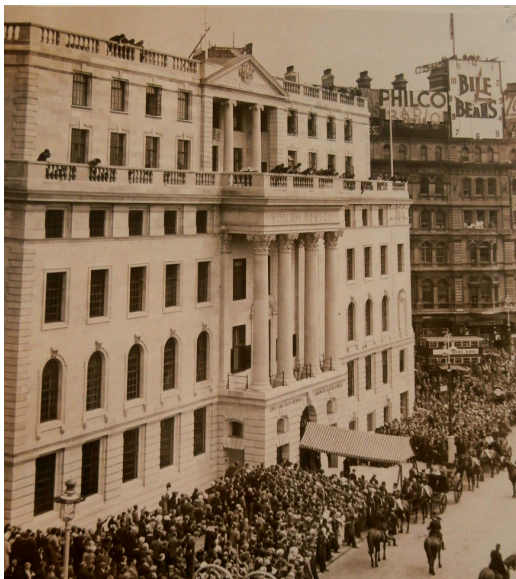
Fig. 3. The state opening of South Africa House on Trafalgar Square (22 June 1933), with the Bile Beans in the distance. Press photo.

extraordinary clock in detail, but soon after the clock would have formed one small part of the mass of twisted metal left by the 1936 fire, and will have ended up as scrap. It thus passed into legend and appears to have been largely forgotten. Robinson's detailed article is reproduced below, with a small elision.