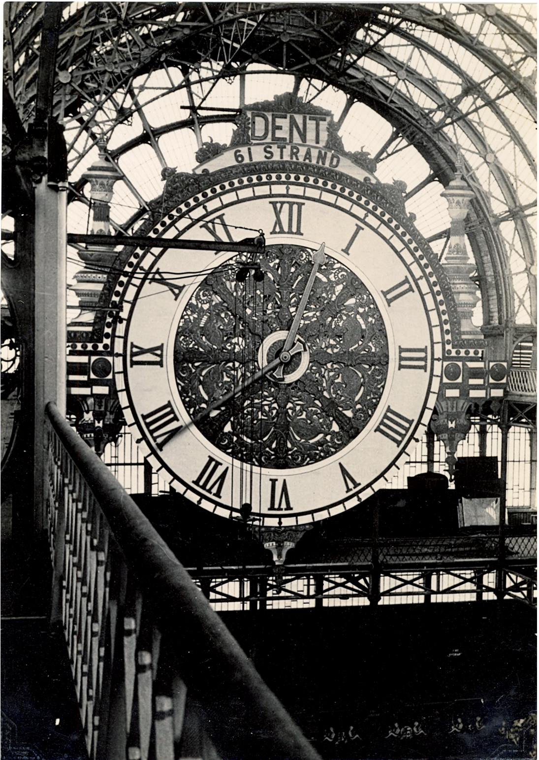
Fig. 4. View of the 40 foot new dial for the clock, at Sydenham, after the 1862 Great Exhibition. Watch & Clockmaker (November 1935).