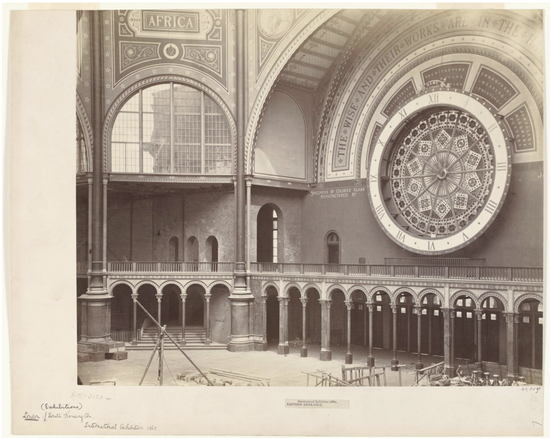
Fig. 1. View of the East Entrance to the International Exhibition Building, South Kensington, 1862, photograph, Victoria and Albert Museum, 41: 219 © V&A, 2014.

installed at Kings Cross station, where it remained until replacement by a synchronous electric clock in 1965. 2 Within a short time Dent also won the contract to provide the clock we all know as Big Ben, though the firm lost Edward John in person with his death in 1853.