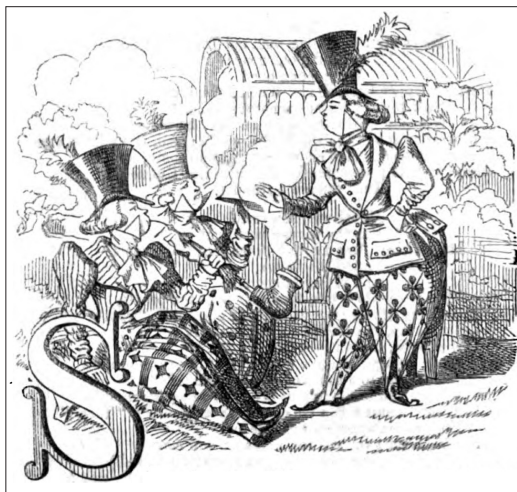
Fig. 1. Cartoon from Punch 29 November 1856 showing the fictitious characters Brown, Jones and Robinson arguing about the origin of the name of Big Ben. In the background is the entrance to the Crystal Palace, which they were about to visit. By then, this famous exhibition building had been transferred to Sydenham south of London. The three gentlemen had been conveyed there from Rotten Row, Hyde Park, in a mere few minutes using a balloon service. Amusingly, the author assumed that mode of local transport to be in operation in 1999, the year in which he set this episode.

as the real person the bell was named after, and it is here that it first makes its appearance.